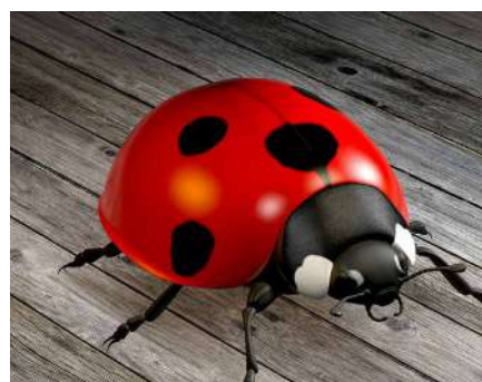
ANIMATOR (CARTOON DESIGNER)