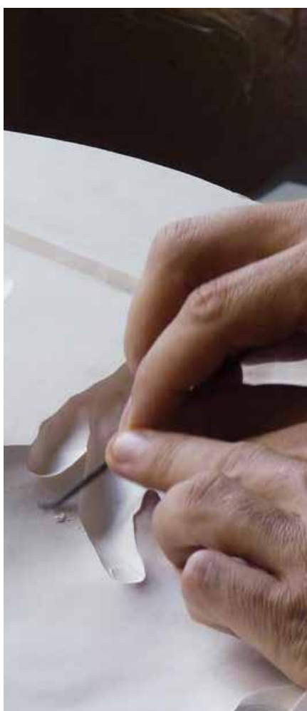
SCULPTEUR (BOIS, MÉTAL, RÉSINE)