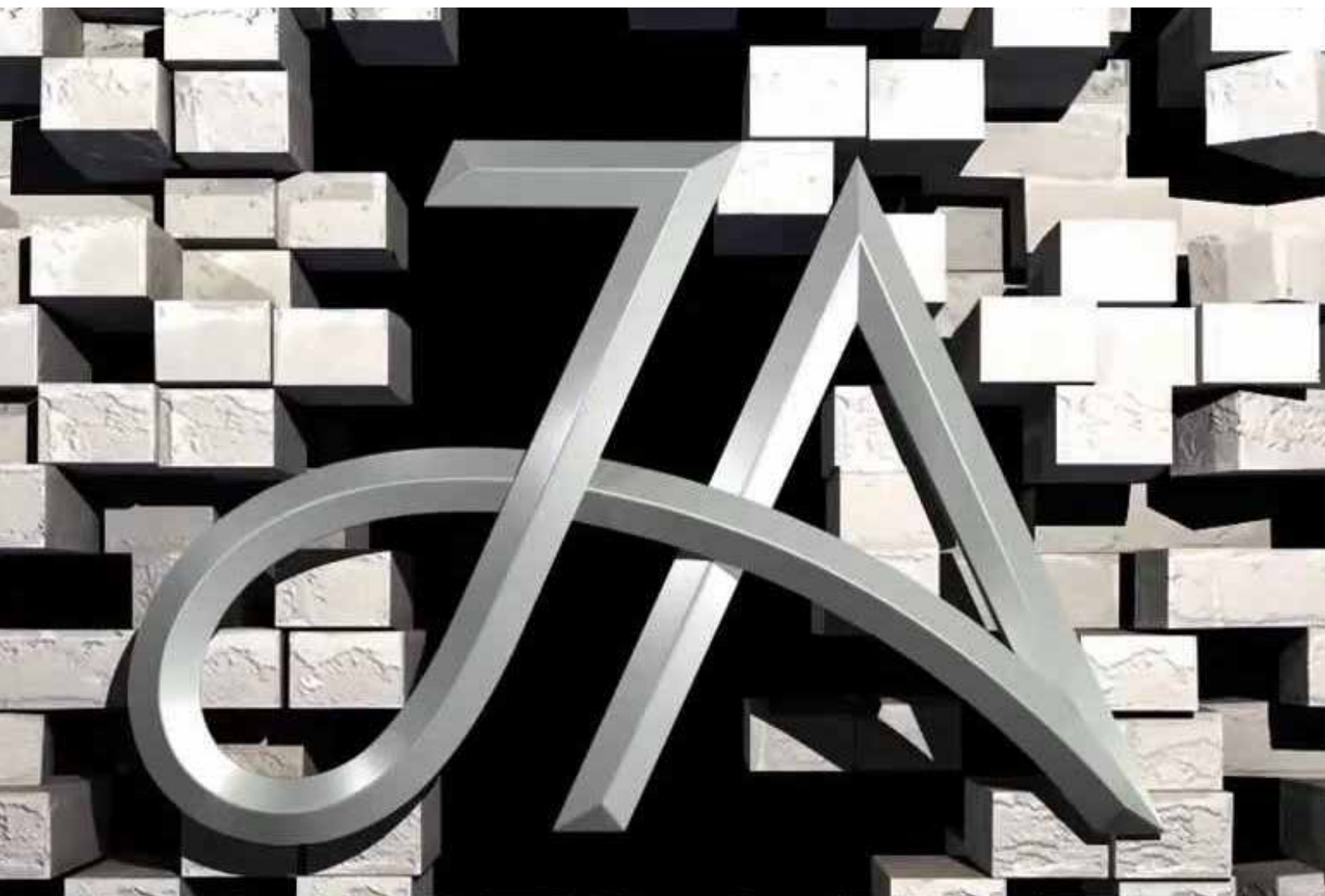
3D Hotel logo by MOF model maker

For its reopening, a hotel group will still be able to see the layout of a reduced object model to display at its entrance hall with the intervention of our “Meilleurs Ouvriers de France” model makers.