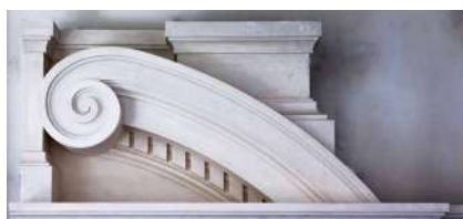
PLASTERER - DECORATOR