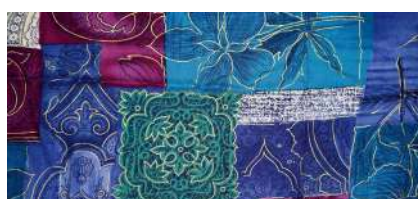
TAPESTRY - DECORATION