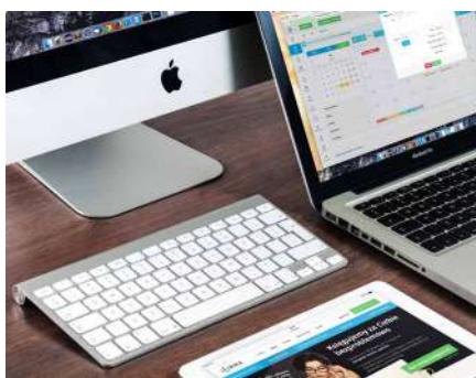
GRAPHIC / WEB DESIGNER