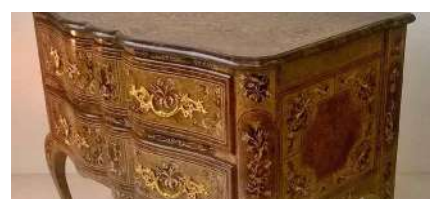
RESTORER OF FURNITURE