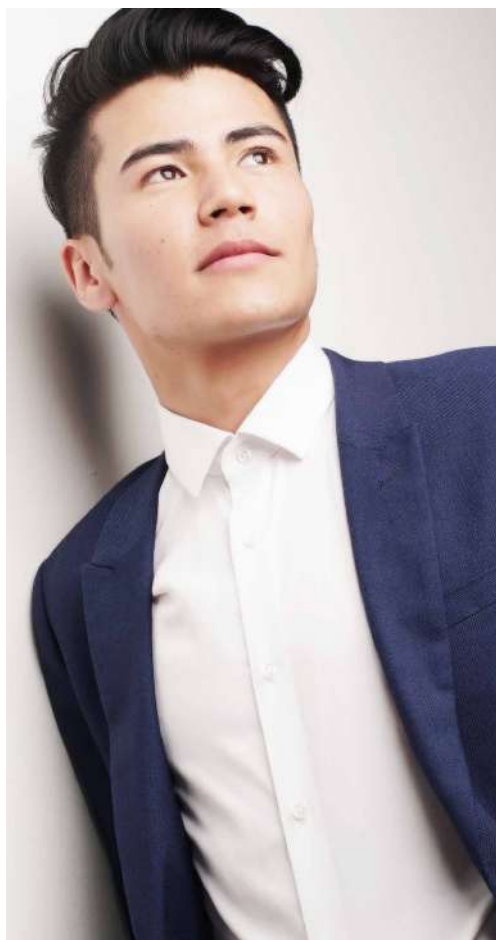
Relooking of hotel staff by MOF hairdresser-visagist