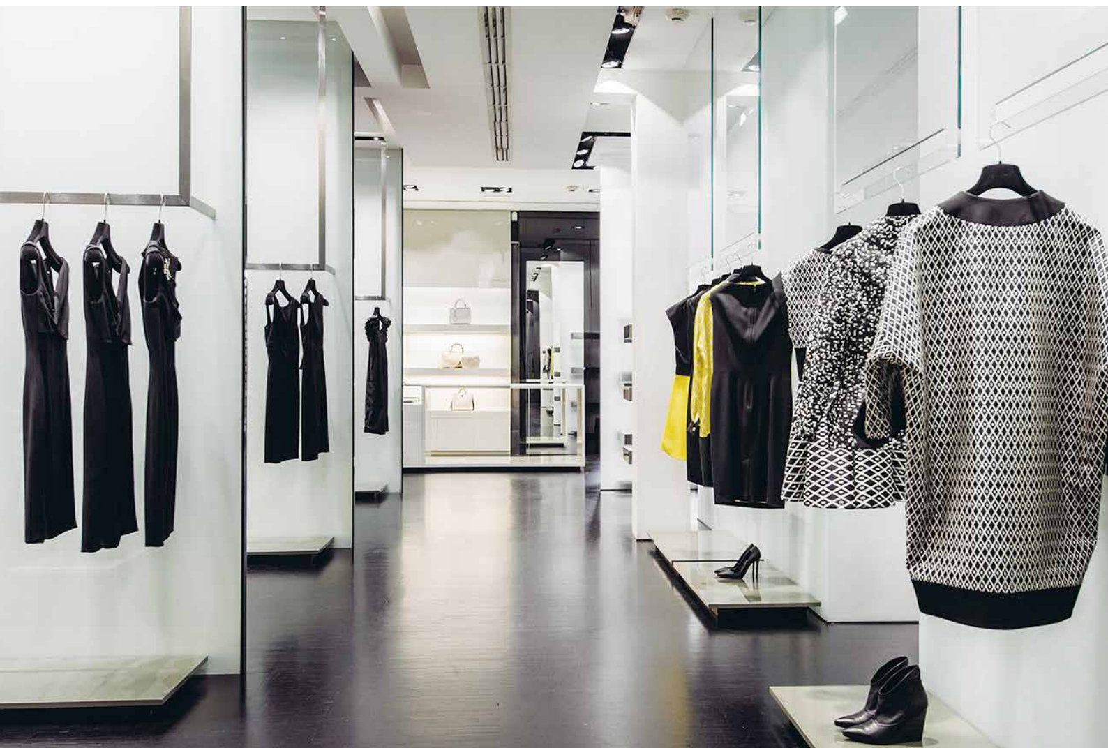
Boutique hotel line by MOF fashion designer

For example, a hotel group can develop a 'Summer clothing line' according to the themes and colours associated with its brand.