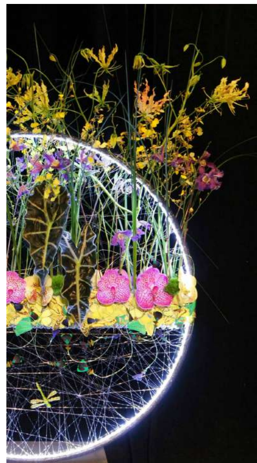
Floral design by MOF grand florist