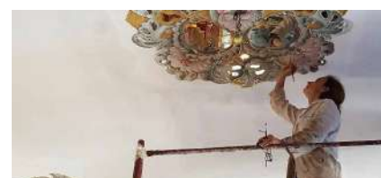
INTERIOR PAINTING AND PAINTING DECORATIONS