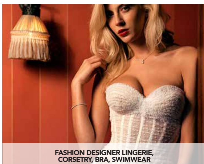
FASHION DESIGNER LINGERIE, CORSETRY, BRA, SWIMWEAR