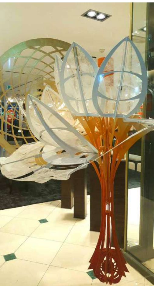
Luxury model by MOF model maker

Our best model makers from France can also create the 3D logo of your establishment in "XXL" size.