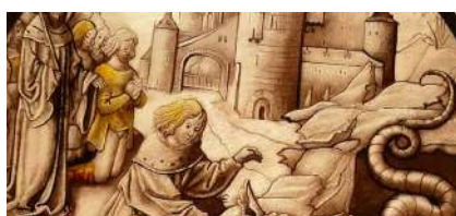
STAINED GLASS AND DECORATIVE MIRRORS