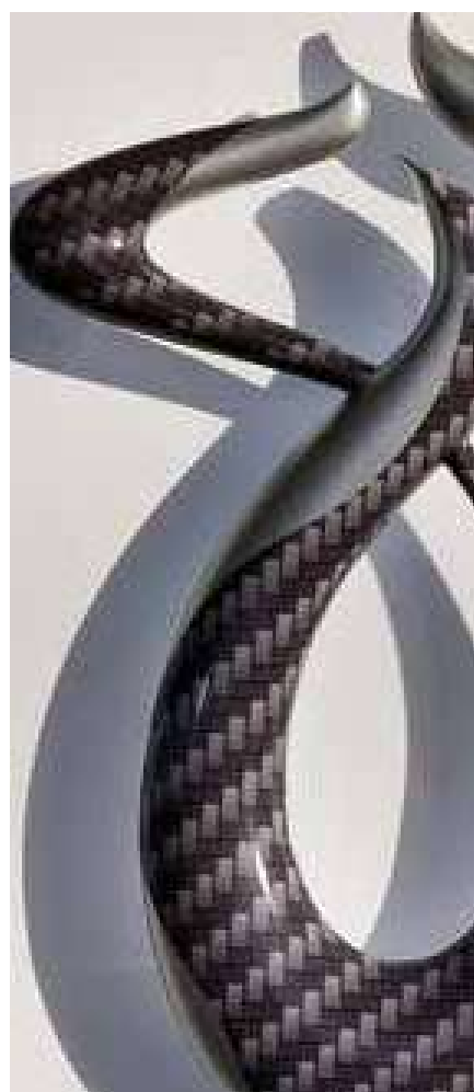
3D MODEL MAKER